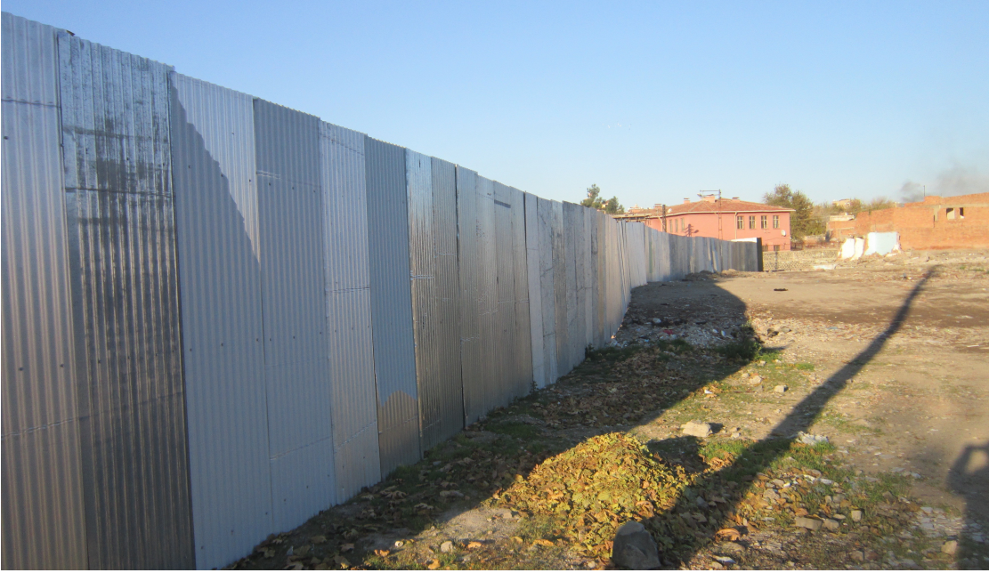
Figure 5.2.9 Construction sites of transformation project in Alipaşa-Lalebey.