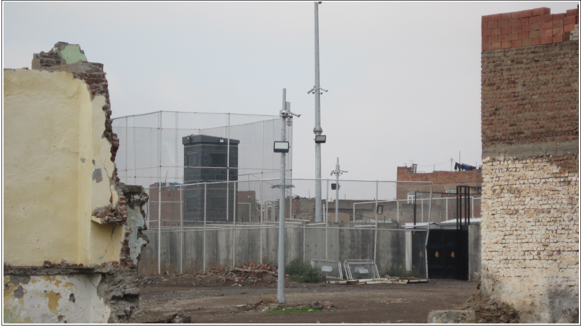
Figure 5.2.4 Security base in urban transformation sites in Suriçi .