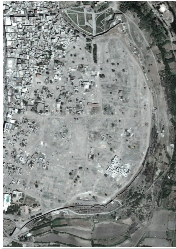
Figure 5.2.1 Aerial caption of destruction in forbidden zone in Suriçi .