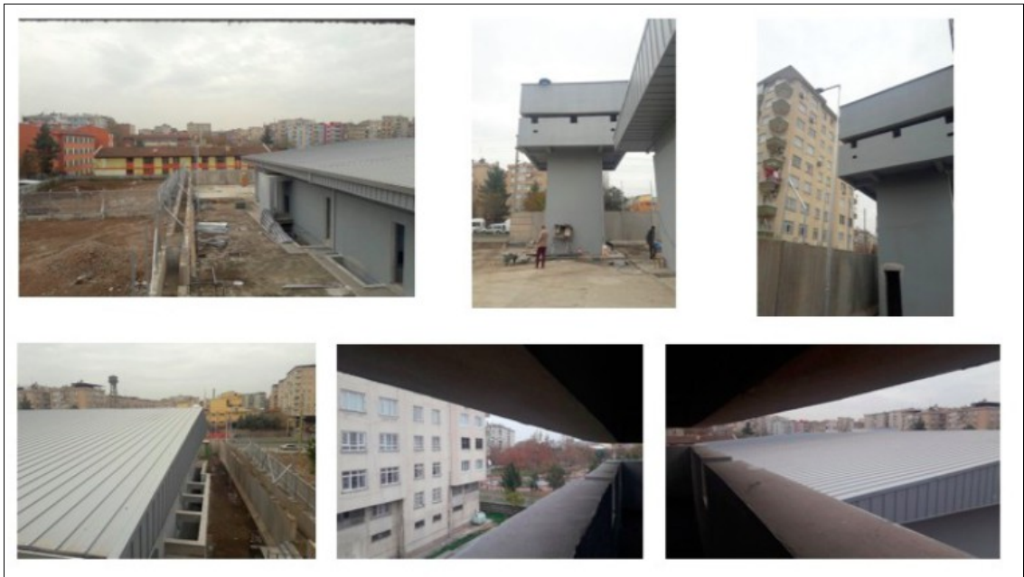
Figure 5.2.3 Construction site of security base in Bağlar district.

apartments evicted and demolished. Their proximity to the settlement areas are significantly high. I observed that the surrounding settlements and the private spaces, where residents having their everyday activities, were constantly under control all the time. Hence, the construction of these solid security bases made the control constant in urban space. Above are some pictures that I took from the construction sites to exemplify this form of control (Figure 5.2.3).