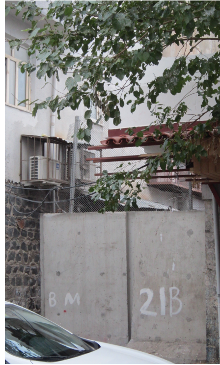
Figure 5.2.8 Concrete block walls separating the forbidden zone in Suriçi .

The level of domination and control by the state security forces through these “restricted areas” was overwhelming because even to look beyond these walls could be perceived as a “threat” and could have devastating results regarding the “safety.” Because of these reasons, I could not enter this forbidden zone in the district, but, I was able to observe Alipaşa and Lalebey neighborhoods, which are located at the west side of the district and adjacent to historical city walls. Unlike the forbidden zone, this part of the district is partially observable where the everyday life and transformation is going side by side. The “first stage of the transformation project” takes place in these neighborhoods. The construction site of transformation project is completely encamped and encapsulated by long metal fences (see Figure 5.2.9).