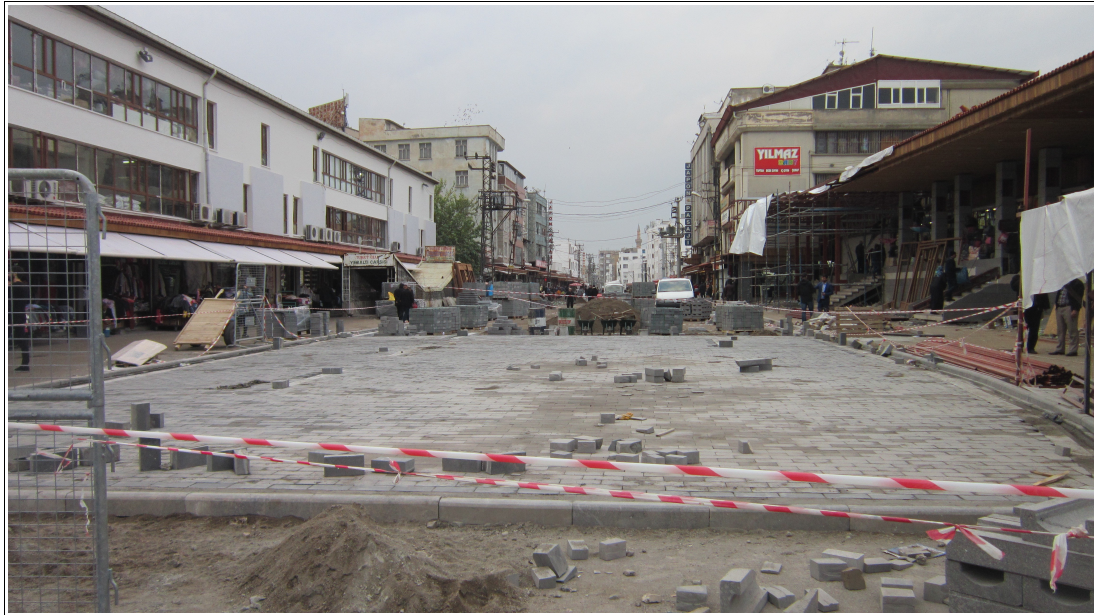
Figure 4.4.1 Urban transformation site in Melik Ahmet boulevard in Suriçi .