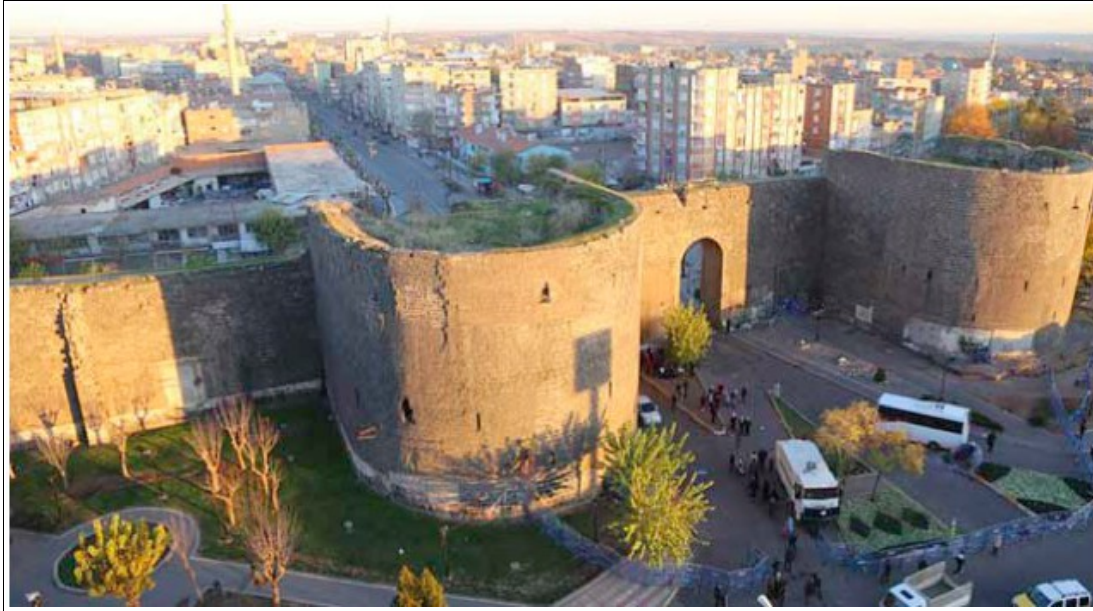
Figure 5.2.2 Security checkpoint in Çiftkapı on entrance of Suriçi .

checkpoints. These checkpoints are constructed upon each of the few entrances through historical city walls. In this way, each and every citizen entering or going out from can be controlled by the officials though video recordings, ID checks and interrogations. The encampment of the district through checkpoints segregate it from the rest of city and giving it an exceptional state of being (Figure 5.2.2) 18 .