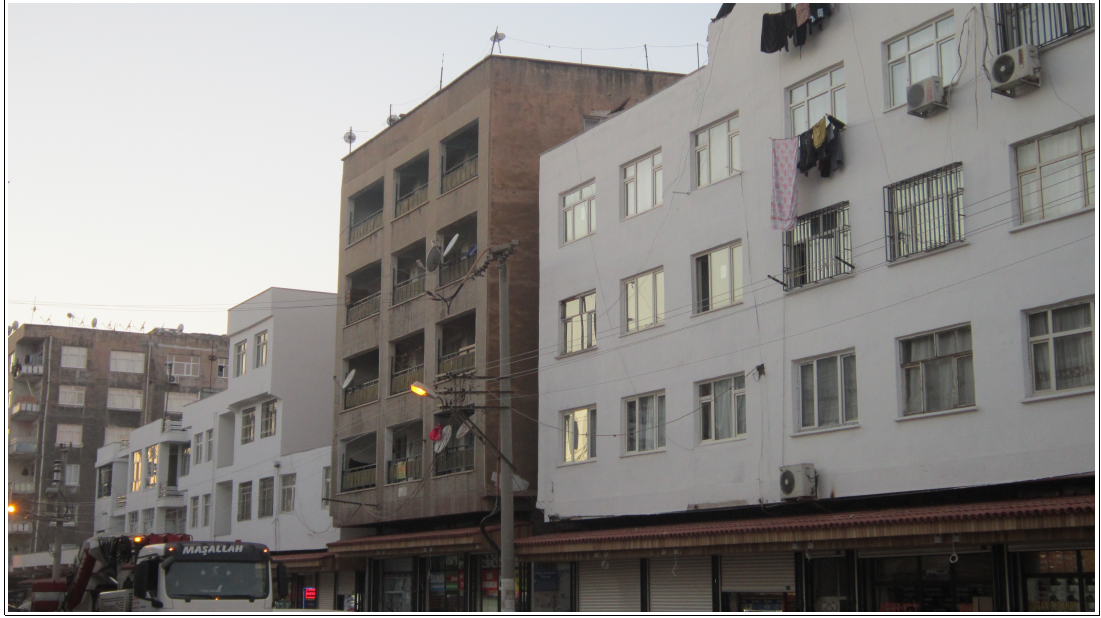
Figure 4.5.1 Transformed facades of buildings in Melik Ahmet Boulevard Suriçi .