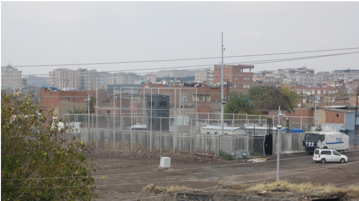
Figure 5.2.5 Security base in urban transformation sites in Suriçi .