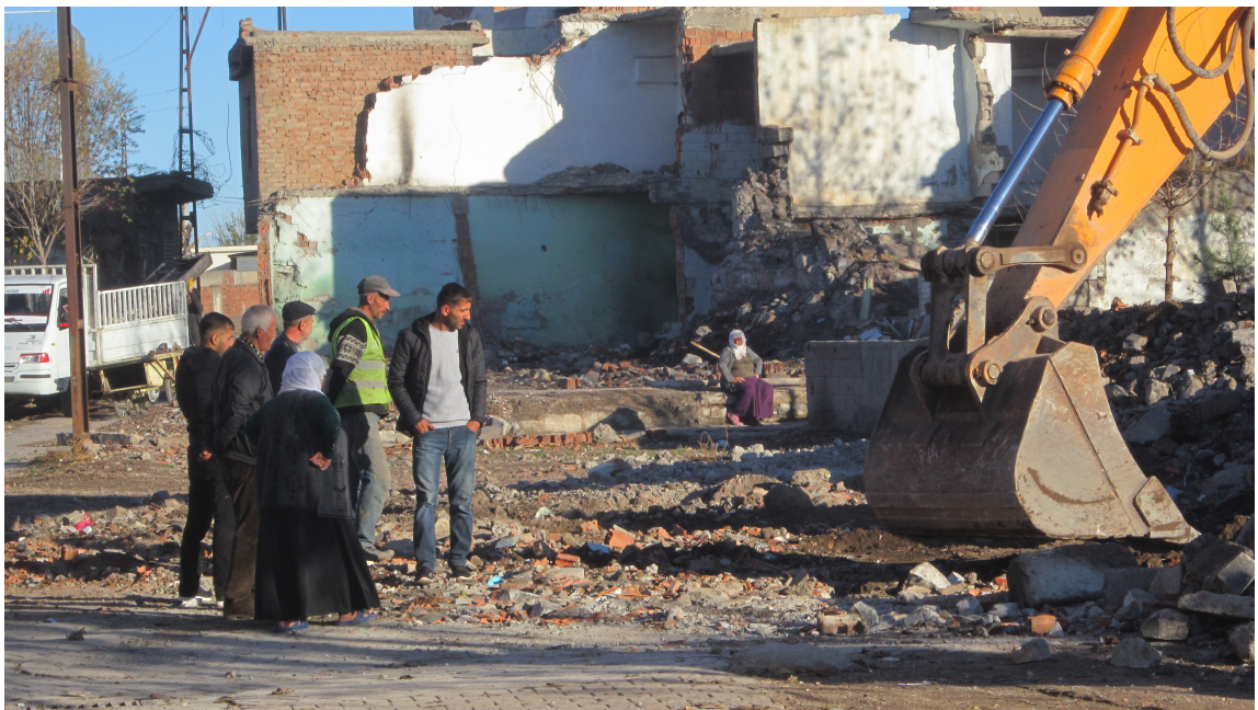
Figure 5.3.1 Destructions in urban transformation site in Alipaşa-Lalebey.

I spent several days in these sites with the families at this critical moment of their lives where they had to watch destruction of their habitat (Figure 5.3.1). I observed that this leads to high degree of despair and resentment among the inhabitants. As this urban transformation is led by state institutions, they experience the mechanisms of power as a destructive machine of the state apparatus. The control in the urban space consolidated through the destructive power of the machine which is also equipped by legal enforcements that gives an unchallenged status-quo to the praxis of the same machine.