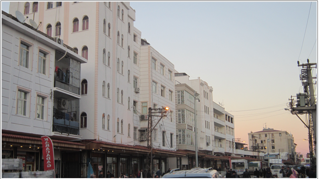
Figure 4.5.2 Transformed facades of buildings in Melik Ahmet Boulevard Suriçi .