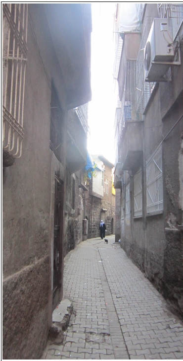
Figure 4.1.1 Peculiar architecture of streets in Suriçi

Such statements made by the residents show us the communal role of the space in their perception. The space turns into a binding factor in the formation of these communities as well as identifications of their members with their relations to each other and as well as with the space itself. The appropriation of space by the newly comer population is significantly dense while through time it creates a new sociality where space itself becomes the focal reference point. In other words, Suriçi becomes more and more organic by close proximities of its residents who form a peculiar social body reflecting existential formation of socio-spatial communities in recently arrived urban habitats.