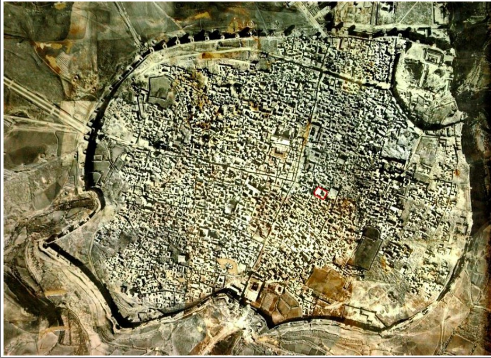
Figure 3.1.1 Aerial caption of Suriçi in 1939

standing since today. Four main doors on the walls named according to their connection functions to the other cities and geographies: Dağkapı (Mountain Door) on North; Urfakapı on West; Mardinkapı on South; Yenikapı/Diclekapı(New Door/Tigris Door) on east (Figure 3.1.1).