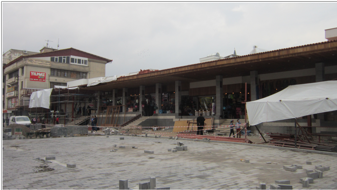
Figure 4.4.2 Urban transformation site of historical bazaar of Balıkçılarbaşı in Suriçi .