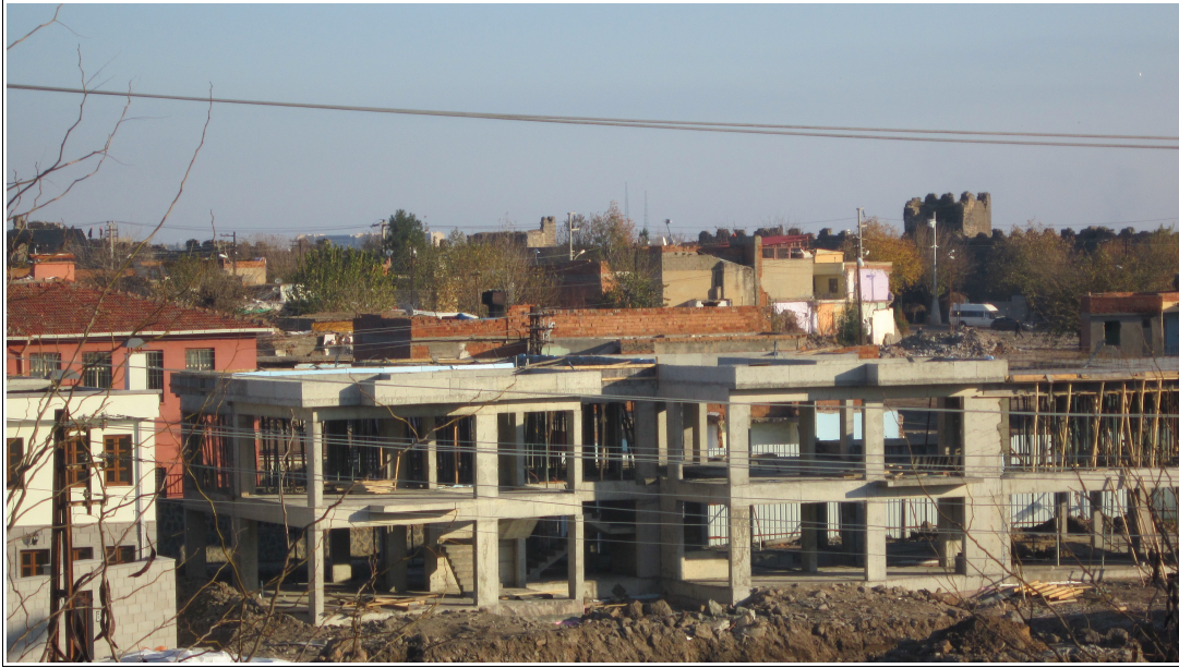
Figure 4.5.4. Construction site of transformation project Alipaşa-Lalebey.