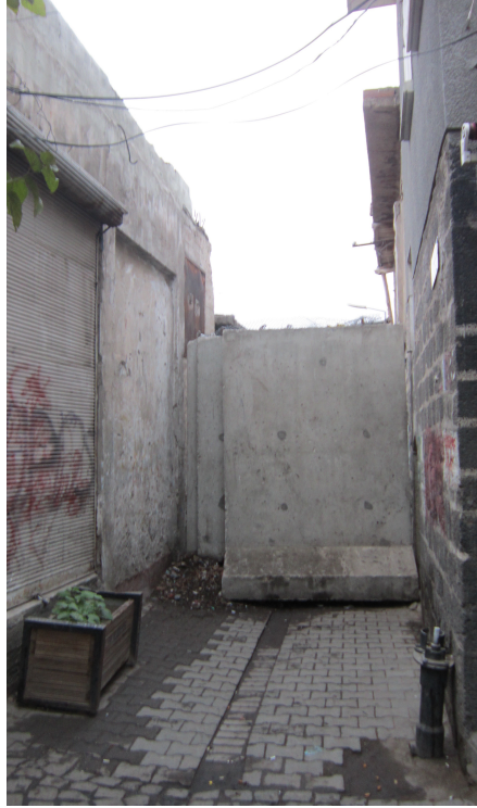
Figure 5.2.7 Concrete block walls separating the forbidden zone in Suriçi .