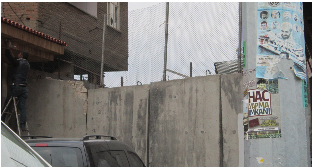
Figure 5.2.6 Concrete block walls separating the forbidden zone in Suriçi .

During the course of my field research the east half of the district was already prohibited as “unpermitted zones” that no one can enter except the state officials. The area was only observable from top of the high structures which were close to it. All of this region was surrounded by the concrete block walls placed in entrance of the each street (see Figure 5.2.6; Figure 5.2.7; Figure 5.2.8). When I tried to look closer to get a better view of this region between the walls, I was warned several times by the local people as well as by security forces that it can be “dangerous” to be nearby these zones.