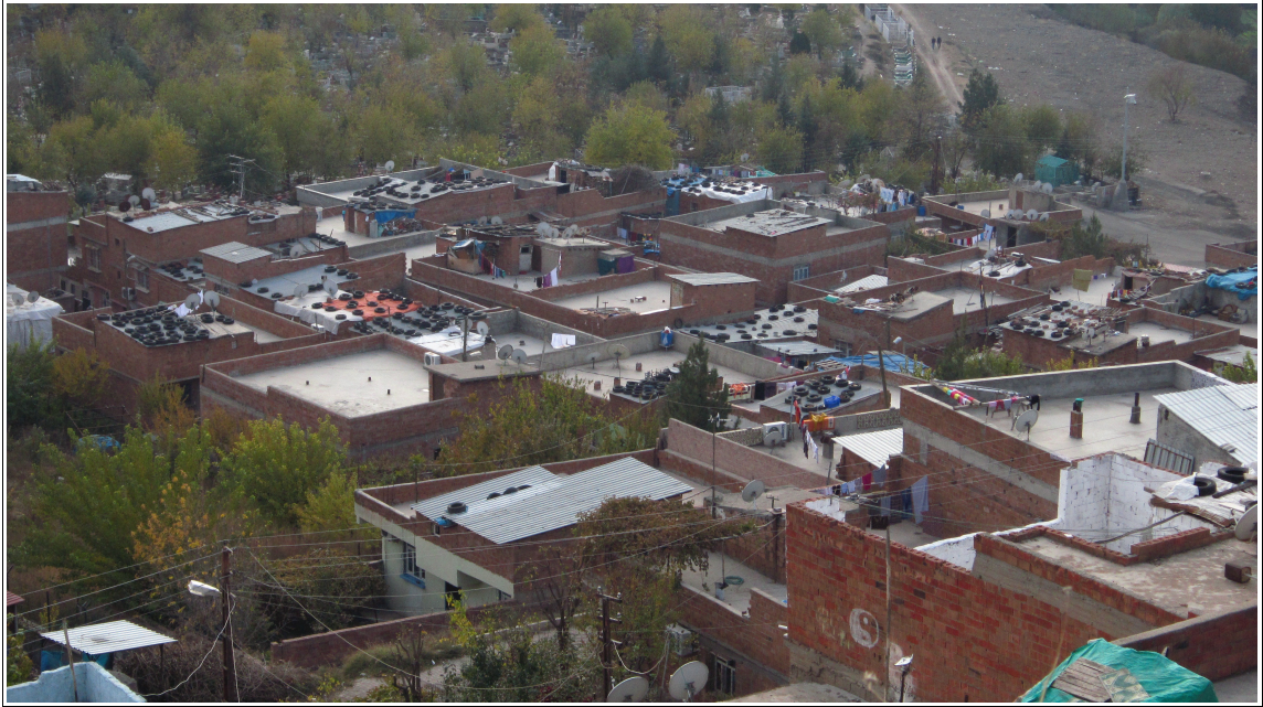
Figure 3.3.2 Ben ü Sen suburbs adjacent to city walls.