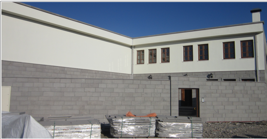
Figure 4.5.5. Construction site of transformation project Alipaşa-Lalebey.