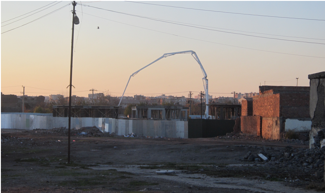
Figure 5.2.10 Construction sites of transformation project in Alipaşa-Lalebey.