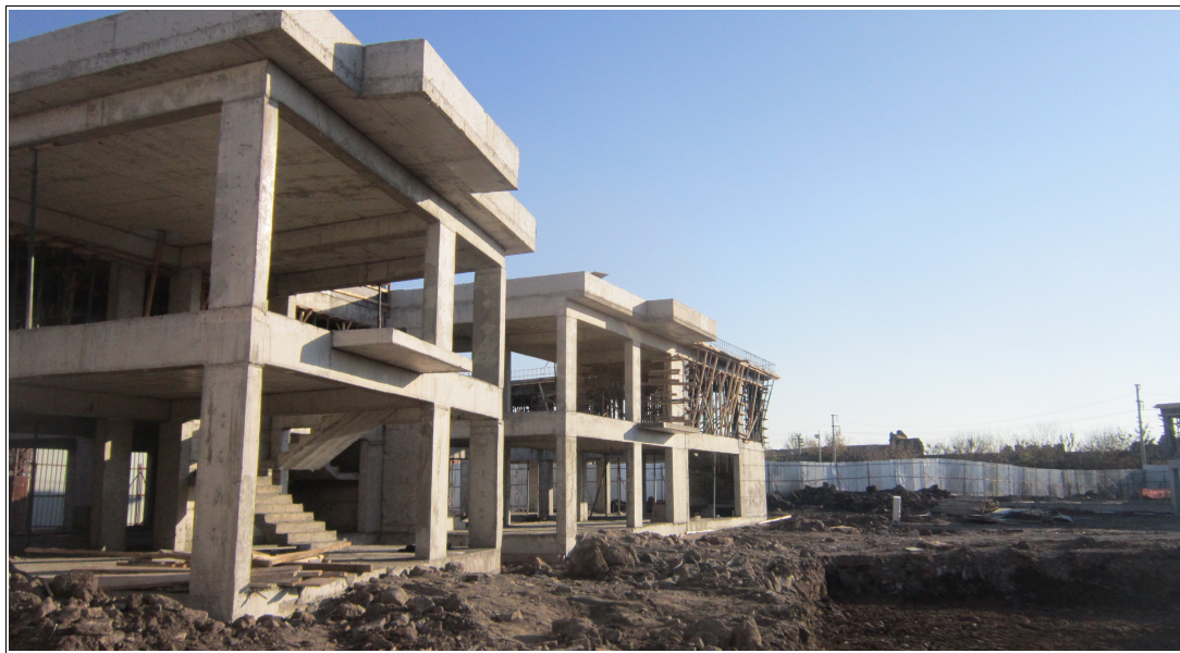
Figure 4.5.3. Construction site of transformation project in Alipaşa-Lalebey.

These critics are important to understand how transformation projects are planned and implemented centrally and practiced totally as an up-to-down process without taking consideration of neither local needs nor architectural peculiarities. In addition to this, here there is an important concept which my interviewee emphasized as “standardization of the spatial environment.” Standardization is one of the significant components of urban transformation projects in the district (Figure 4.5.3; Figure 4.5.4). There are dozens of newly constructed buildings in the transformation sites which are planned to be finished during the following months. One of the interviewed construction officials in the transformation sites states that it would not be easy to sell these buildings because their architectural plans are not suitable for proper family living. They were built as separated units divided by walls which makes it impossible to conduct any social interaction between the households.