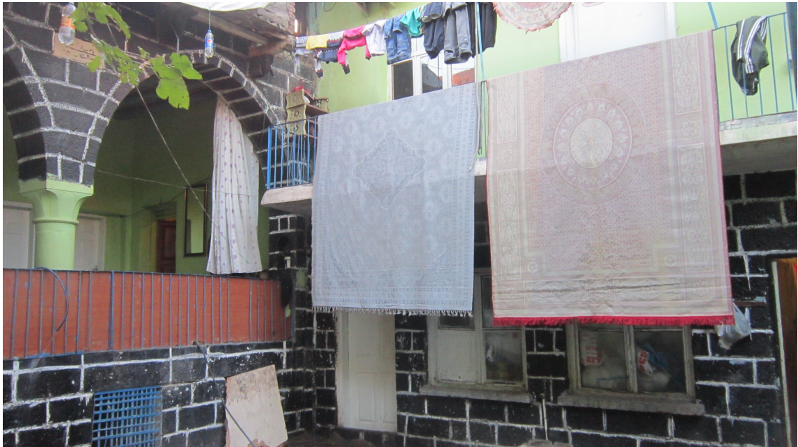
Figure 4.1.3 Typical architecture of Avlu in Suriçi

Suriçi provides the necessary frame for such communal relations through its historically built narrow streets (see Figure 4.1.1; Figure 4.1.2) and the lively social environment, for the families to form strong local social communities. The physical environment in Suriçi constructs and also reflects the vivid social life of local communities based on strong social ties inside and outside of the households. Thanks to the common narrowness of the streets that any vehicles can not easily passed through, the alleys of the district also evolved in a way that families were using them as communal public spheres.