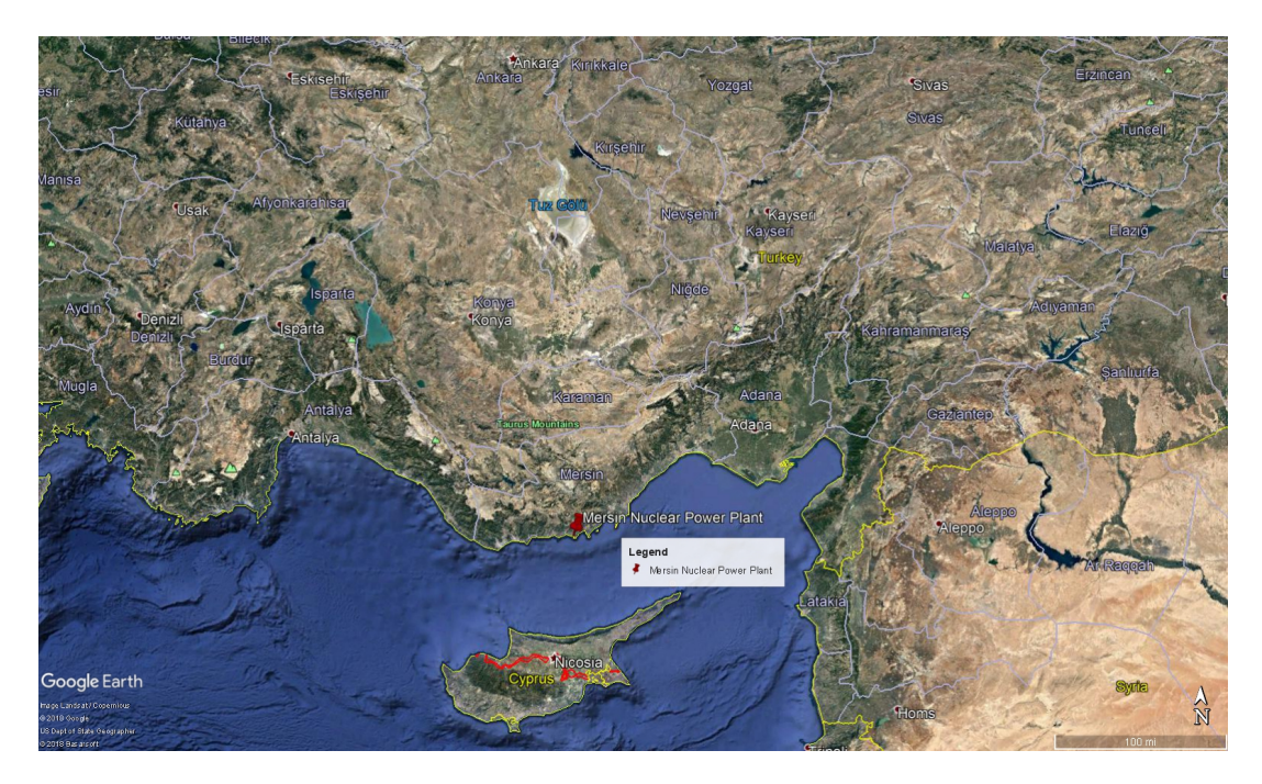
Figure 3.1.1: General view of Mersin-Akkuyu NPP construction site

General view of the candidate sites are given in Figures 3.1.1 and 3.1.2.