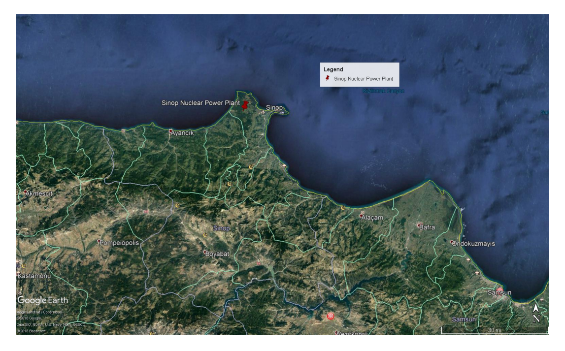
Figure 3.1.2: General view of Sinop-Abalı NPP construction site

Other important objective is to minimize the effect of natural hazards on NPP sites. To illustrate, earthquakes, tsunamis, extreme weather conditions including extreme precipitation, wind speed or droughts may have some negative impacts on the NPP. To overcome the negative effect natural hazards, the assessment of seismic, tsunami and extreme wind hazards are performed for both of the candidate sites.