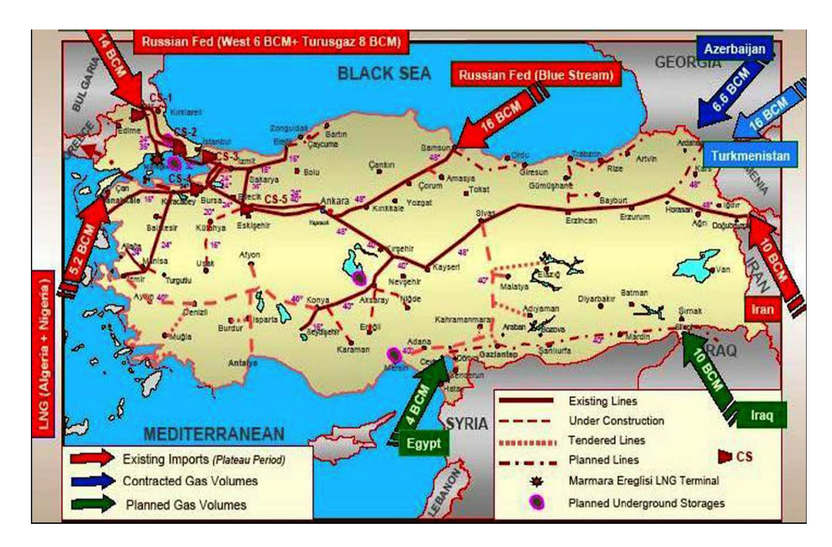
Figure 1: Natural Gas Infrastructure in Turkey

By 2010, over 30 percent of imports are supposed to be taken from Russia via the Blue Stream, more than 25 percent from Russia via Bulgaria, 20 percent from Iran, about 13 percent from Azerbaijan, and the remaining imports from Algeria and Nigeria.<sup>56</sup> With Azeri gas, Turkey hopes to gain a stronger position against Russia and Iran. It also looks forward to buying cheap Azeri gas, because the Russian ($243 in 2005) and Iranian ($263 in 2005) gas remained highly expensive.<sup>57</sup>