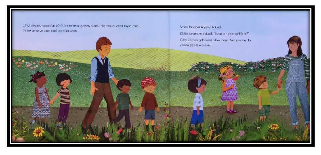
Figure 9: An example of a male teacher and a female farmer (Book 34)

Here are such examples of illustrations and texts from the books: