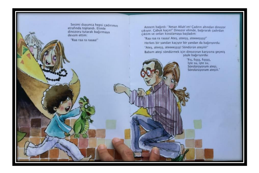
Figure 4: An example of home-based activities (Book 35)

Another example is from one of the translated books, which is about visiting a doctor. In this book, the father is pictured while he is changing his son's clothes as a counterexample of stereotypical gender roles (Figure 4).