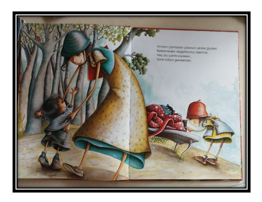
Figure 3: An example of a child care activities (Book 23)

In another native book, the mother is pictured with her children while she is changing the clothes of one of them (Figure 2). This example supports the stereotypical representation of the female assuming the child care role.