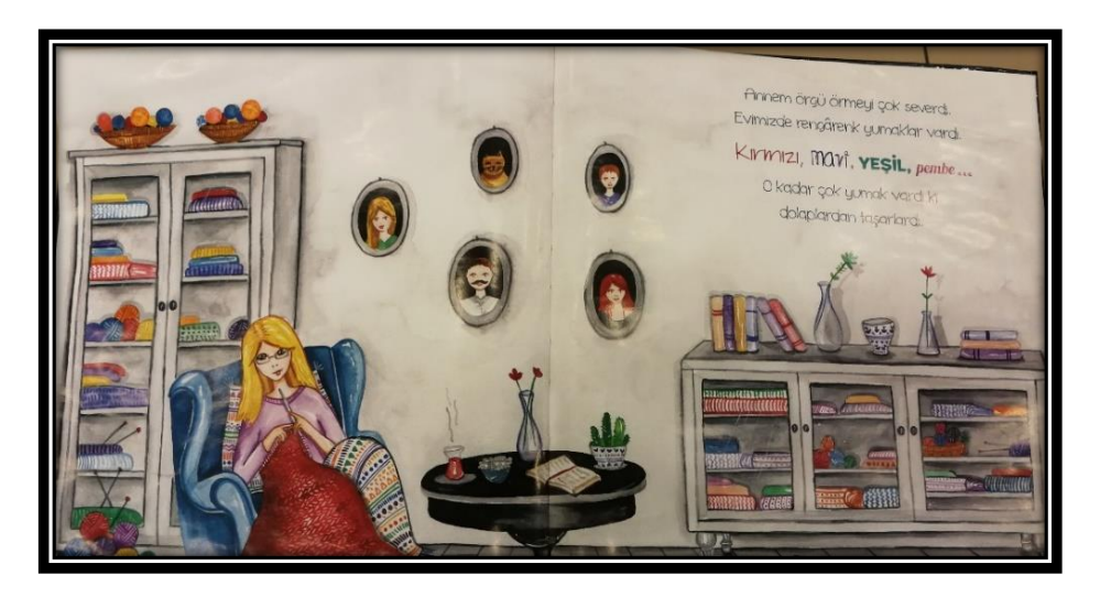
Figure 5: An example of home-based leisure activities (Book 15)

Here are some examples of texts and illustrations from the books: In one of the native books, the female character is pictured while knitting as a home-based leisure activity (Figure 5). Knitting is an activity which is attributed to female characters, and this picture supports the stereotypical representation of a female.