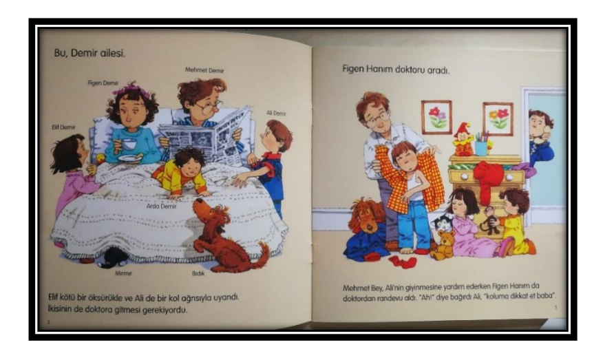
Figure 5: An example of child care activities (Book 53)

Another example is from one of the translated books, which is about visiting a doctor. In this book, the father is pictured while he is changing his son's clothes as a counterexample of stereotypical gender roles (Figure 4).