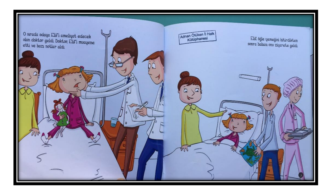
Figure 10: An example of male doctor-female hospital staff) (Book 8)

In this example, while male characters are mostly depicted as holding higher positions, females are depicted as holding lower-level job positions, and this supports the stereotypical gender representations.