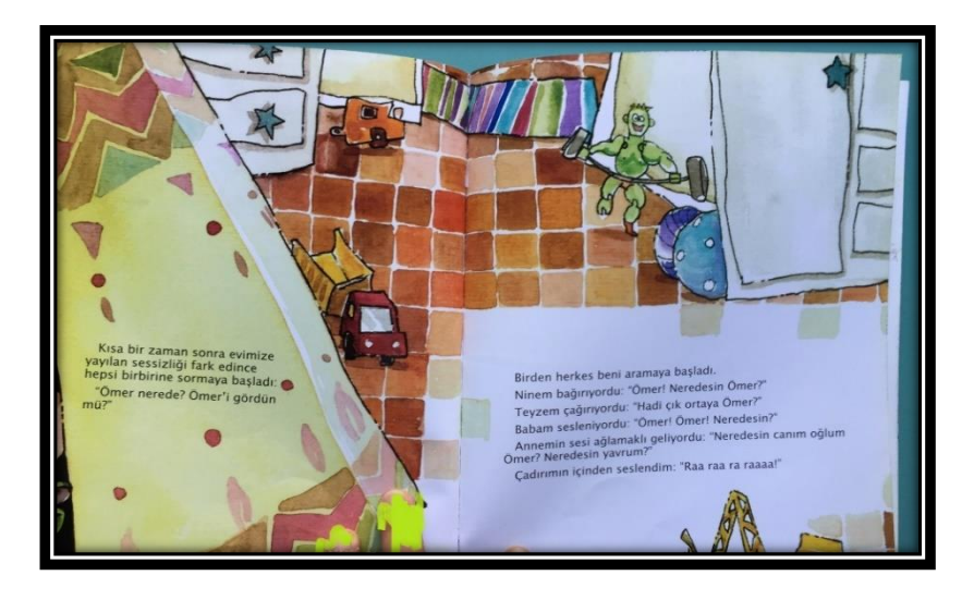
Figure 12: An example of truck, car and ball (Book 35) 69

Another example is from a translated book. As it is seen in Figure 12, there is a truck, a car and balls in the room of the boy. This picture also reinforces the gender stereotyping in toys.