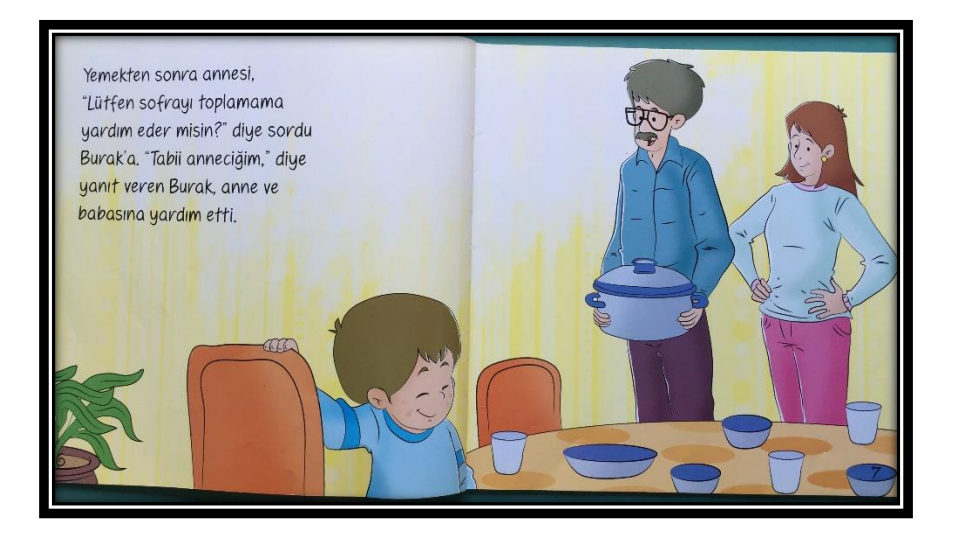
Figure 8: An example of household activities (Book 6)

In another native book, the male character is depicted while cleaning the dinner table, opposing stereotypical representations (Figure 8).