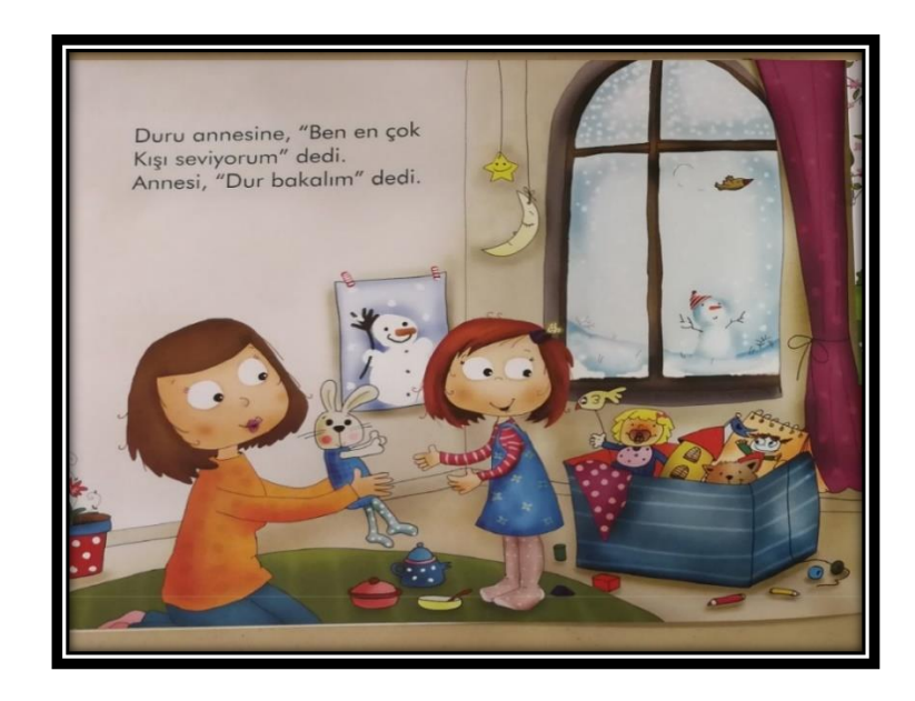
Figure 11: An example of kitchen toys, doll and plush (Book 16)

In one of the native books, the female child character is pictured with kitchen toys, dolls and plushes as seen in Figure 11. This example also supports the stereotypical representation of the female gender with the toys which are mostly associated with female characters.