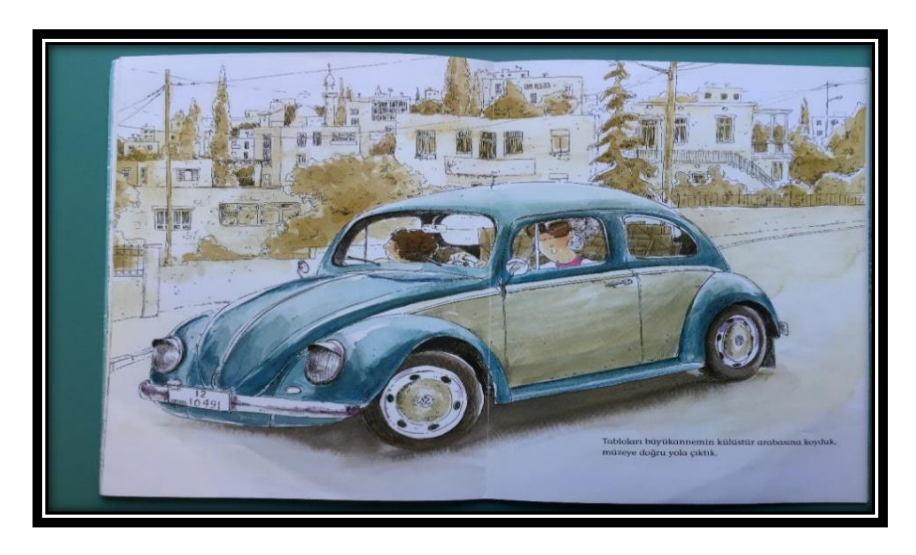
Figure 6: An example of outdoor leisure activities (Book 39)

Another example is from a translated storybook and it is about a grandmother spending time with her grandson. The female character is presented while driving a car as an outdoor leisure activity (Figure 6). While driving is mostly associated with male characters, here, it can be seen as a challenge to the stereotypical representation that the female character is presented while driving.