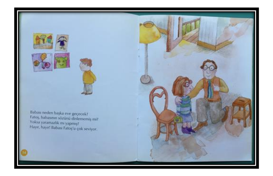
Figure 2: An example of home-based parental activities (Book 4)

In another native book, the mother is pictured with her children while she is changing the clothes of one of them (Figure 2). This example supports the stereotypical representation of the female assuming the child care role.