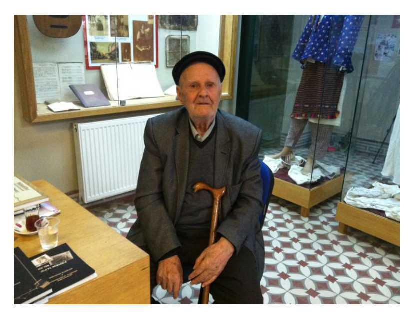
A first generation exchange migrant from Neapoli, aged 97, we also conducted an interview with him.