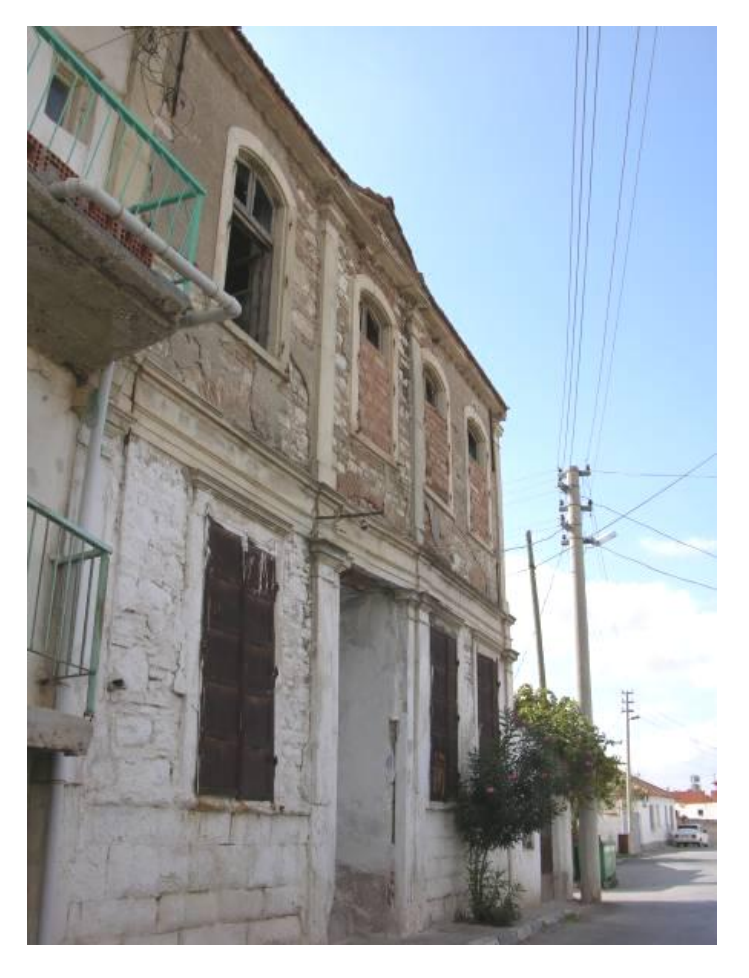
A house emptied by the Greek Exchange migrants back in 1923. The house is empty and not used until then.

Muslim migrants houses provided by the government, they stil use these houses however of course they have been restored.