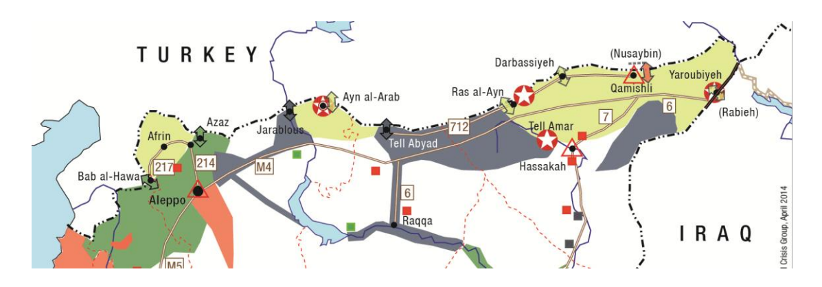
Figure 2: The geography of Kobanê (Ayn al-Arab) in Rojava map<sup>217</sup>

After the canton of Kobanê was surrounded by the ISIS, Turkey became the only place where people could have their needs met. Kobanê is geographically separated from the other regions under the control of the PYD as seen on the map below.<sup>215</sup> However Turkey closed its border which was a message to Kurdish people to "go surrender to ISIS."<sup>216</sup>