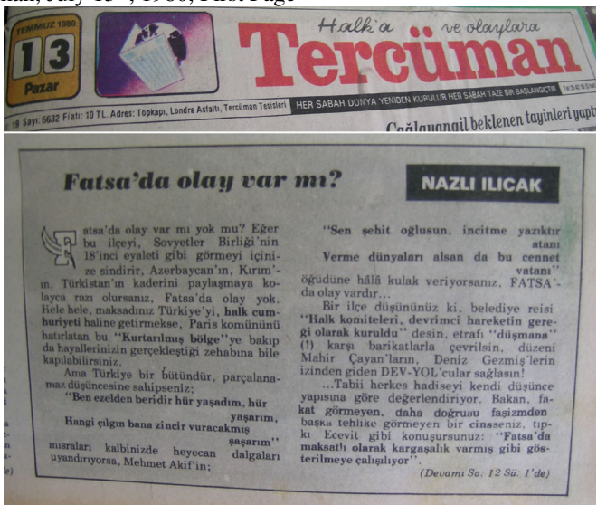
Figure 14: Tercüman, July 13th, 1980, First Page