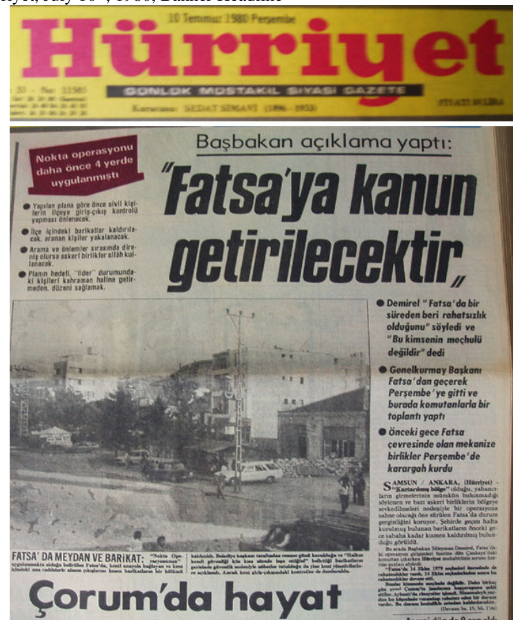
Figure 3: Hürriyet, July 10<sup>th</sup>, 1980, Banner Headline