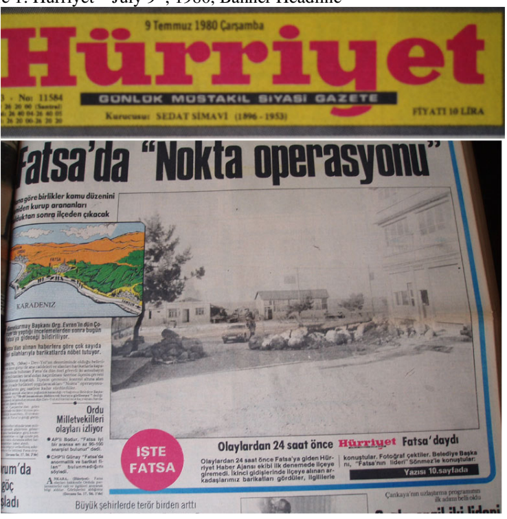
Figure 1: Hürriyet – July 9<sup>th</sup>, 1980, Banner Headline